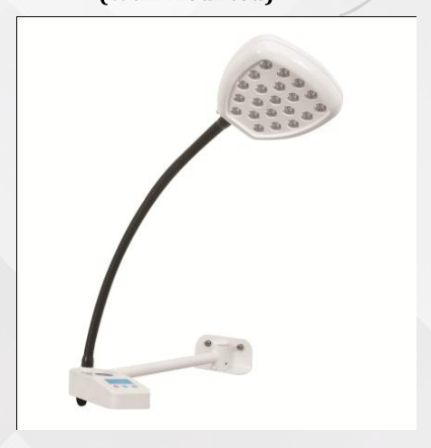
(Wall Mounted with Extended Rod)